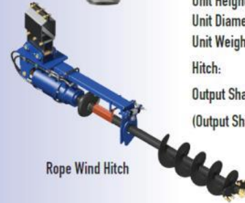
Rope Wind Hitch

Torque Range: 2,098-6,819 Nm Oil Pressure Range: 80-260 Bar Oil Flow Range: 15-50 lpm Speed Range: 9-30 rpm Unit Height: 780 mm Unit Diameter: 269 mm Unit Weight: 110 kg Hitch: Rope Wind Hitch Output Shaft Std: 75mm Square (Output Shaft adaptors available)